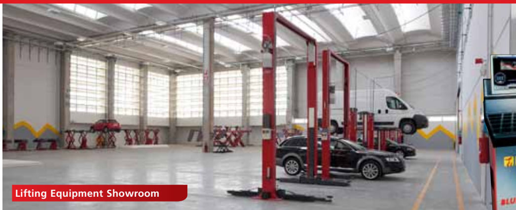
Lifting Equipment Showroom