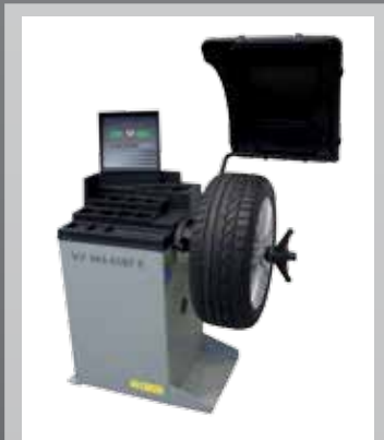
VAS 6587 C