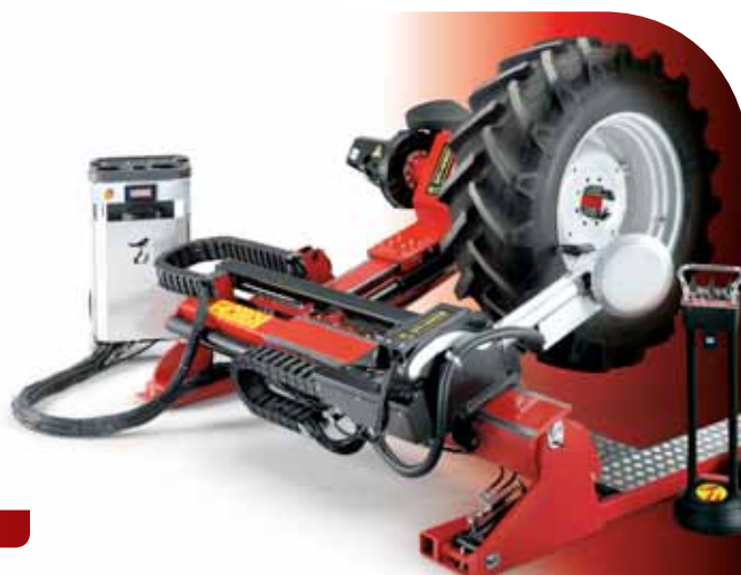
MONSTER AG TT