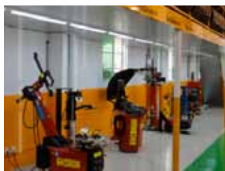
Continental Best Drive Shop

Corghi's development strategy in the so-called BRIC markets (Brazil, Russia, India and China) is the main guideline for growth. For this reason the company is making significant investments in both the manufacturing and commercial side, investments that are already starting to bear fruit.