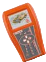
POKAYOKE - Management of vehicle's electronics