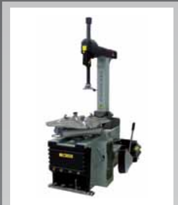
VAS 6302 C