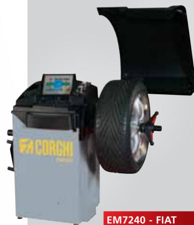
EM7240 - FIAT

for the motorbike line. In this island the EM 7240 wheel balancer, the BC200S motorbike tyre changer line BC200S and the BL600 hydraulic lift are displayed.