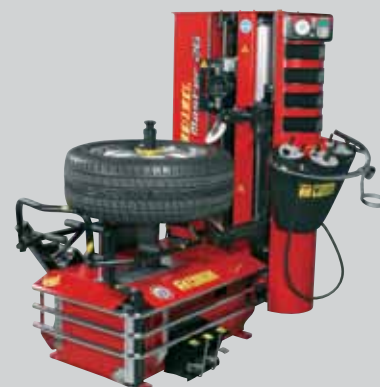
ARTIGLIO MASTER 26"