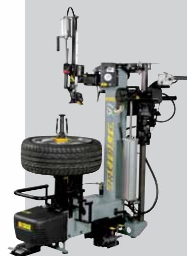
ARTIGLIO 50 - FIAT