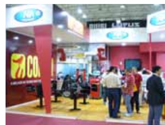
Corgi Stand - San Paolo